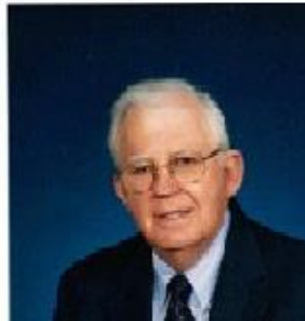
Evangelist BOBBY JACKSON